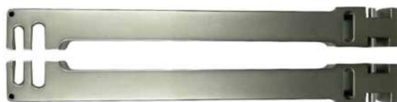
Plate bending wrench 2 x1