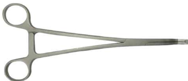
Plate holding forcep

Specifications, size, shape subject to change without notice. Picture shape if similar to any other manufacturers is just a co-incident.