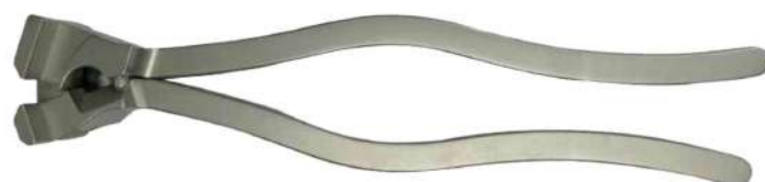
Plate bending forcep

Specifications, size, shape subject to change without notice. Picture shape if similar to any other manufacturers is just a co-incident.